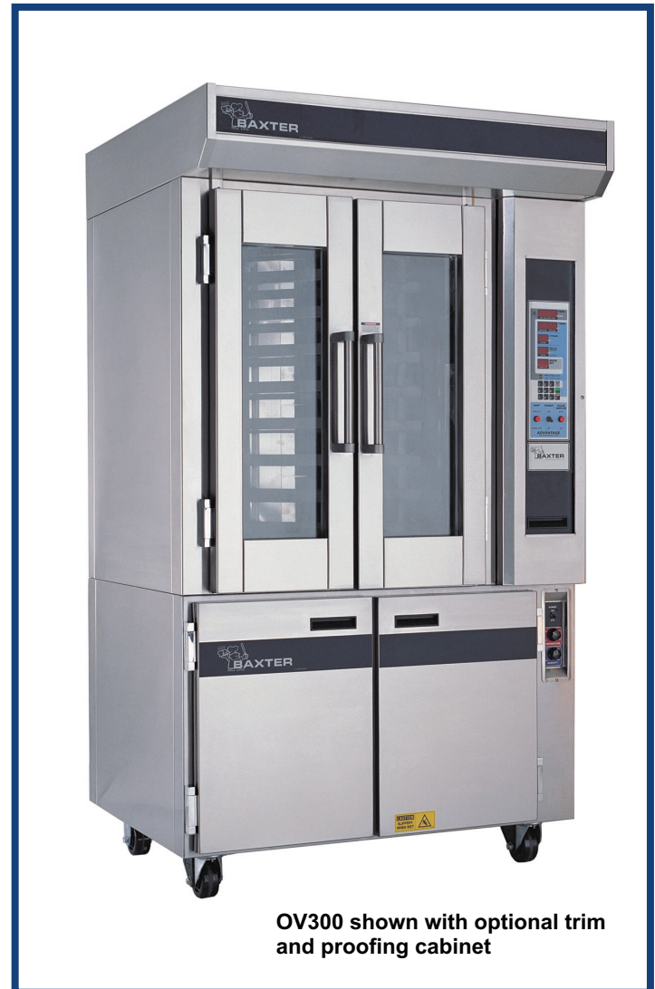
OV300 shown with optional trim and proofing cabinet

Durable stainless steel construction lasts for years.