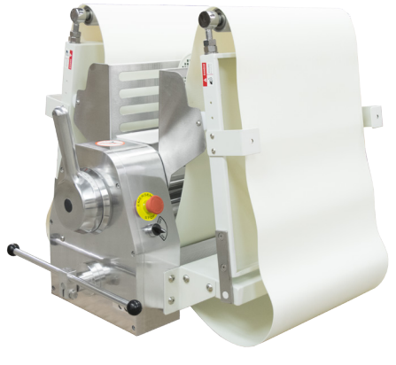
Permanently Lubricated Steel Gears And Chain For Years Of Worry Free Use!