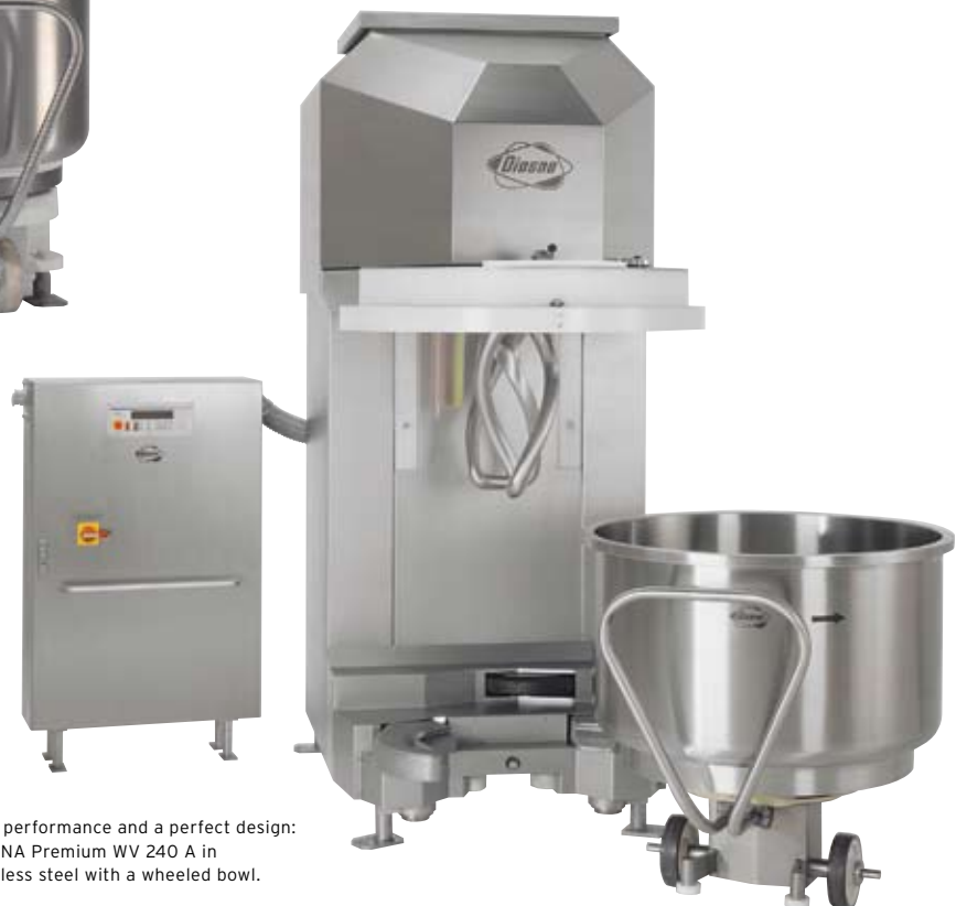
High performance and a perfect design: DIOSNA Premium WV 240 A in stainless steel with a wheeled bowl.

The special speed ratio of the mixing tool and the bowl guarantees highly homogeneous mixing and intensive kneading.