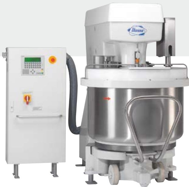
W 240 A Wendel Mixer in a painted version.

The special speed ratio of the mixing tool and the bowl guarantees highly homogeneous mixing and intensive kneading.