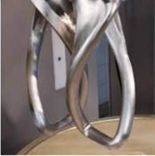
Wendel kneading tool

The principle of the DIOSNA Wendel Mixer is based on two kneading tools, installed off-centre, which turn in opposite directions and are lowered into the rotating bowl. This creates a special spiralling movement which enables dough to be created fast and carefully, with the dough hardly warming up.