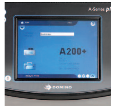
Optional touch screen control