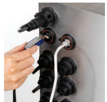
Ethernet and USB ports as standard