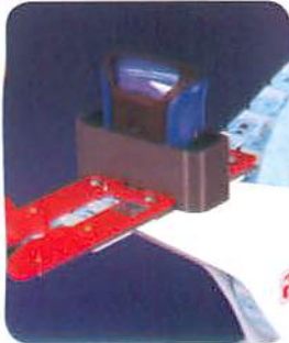
P18-00163 PRINTER (1002F Model C)