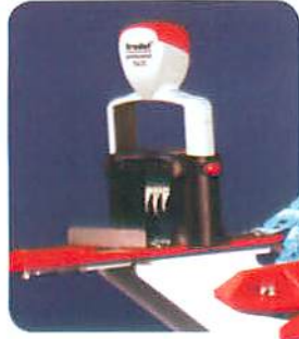
P18-00094 PRINTER (1002F Model D)