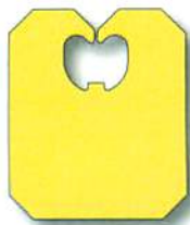
Series R (medium duty) Series S (heavy duty)

The Model C features a Trodat® printer which uses "grooved, press-on" rubber type. Press-on type permits customizing of imprint copy. The Model D features a Trodat Band Printer for printing dates. Models C & D require the use of Series "RL" or "SL" closures. These closures are manufactured with a small paper label affixed to the closure.