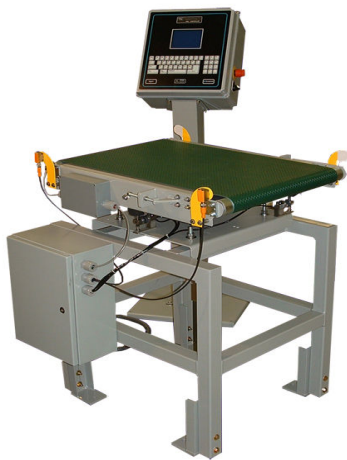
Single Scale Conveyor

Several weigh station conveyor lengths and widths are available to meet your specific application needs. Metering, pacing, reject, and material handling conveyors are available as well.