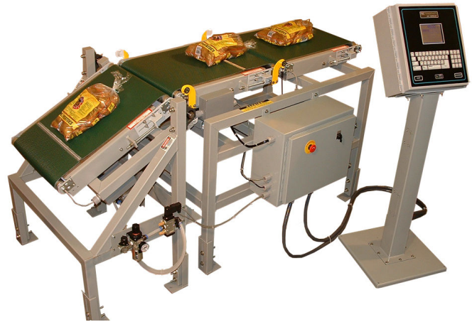
In-feed, Scale & Drop-Nose Reject System

This checkweigher includes Thompson Scale's Model 4693 Checkweigher Controller, providing an extensive feature set with the highest possible accuracy for a load cell based scale. The controller provides easy to read menus with both English and Spanish in full sentences for better comprehension. On-board self-diagnostics display errors or problems onscreen. Options, such as our Statistical Process Reporting (STPR) package, print unit weights and summary production reports, and a full compliment of I/O allow for easy expansion to meet your future integration needs. The 4693si Checkweigher is a highly flexible and reliable solution to all your needs.