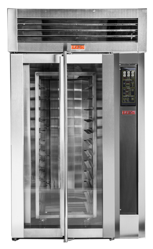
LMO Max-G (Rack not included) Note: Oven must be installed under a hood