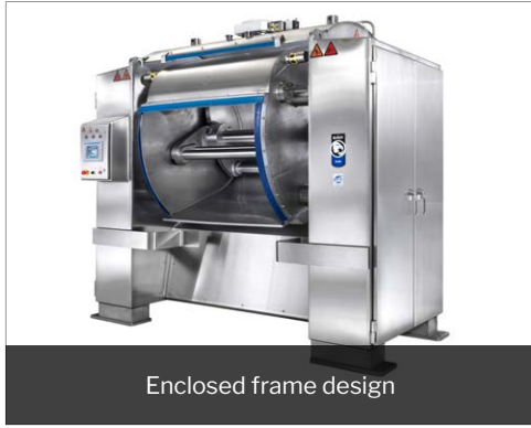
Enclosed frame design