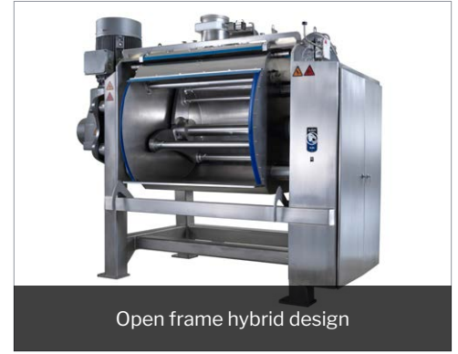
Open frame hybrid design