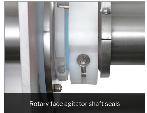
Rotary face agitator shaft seals

For additional information or to request a quote, call +1.937.652.2151 or email info@shaffermixers.com .