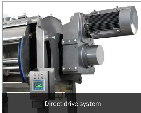
Direct drive system