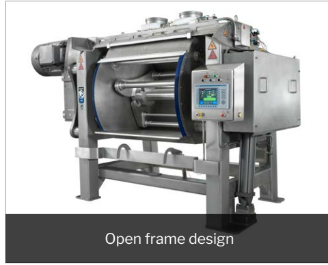
Open frame design