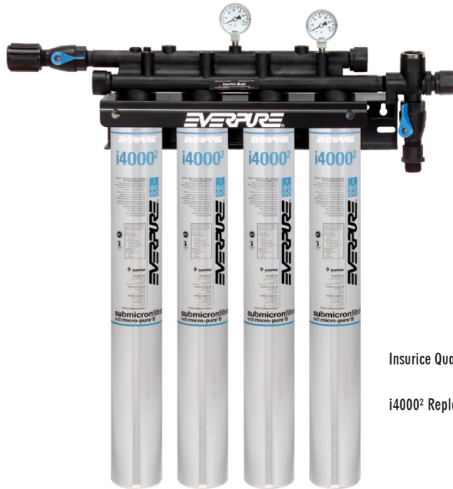
Insurice Quad-i4000 2 System: EV9325-04

Delivers premium quality water for ice applications