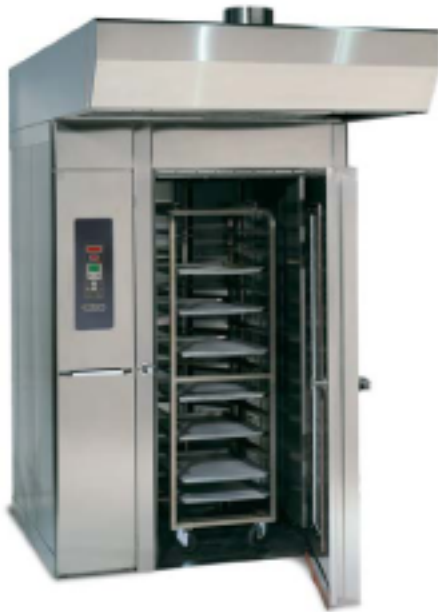
Model LRO-1 Shown (Rack not included)