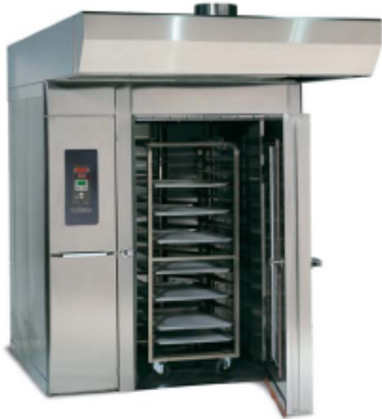
Model LRO-2 Shown (Rack not included)