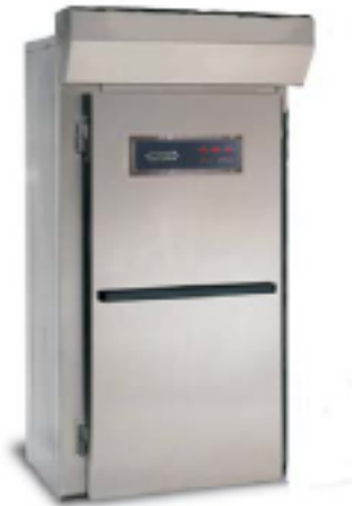
Model LRPR1-40HO Shown