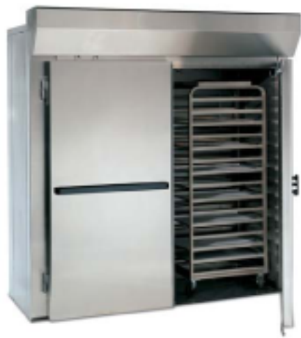
Model LRPR2-40HO Shown