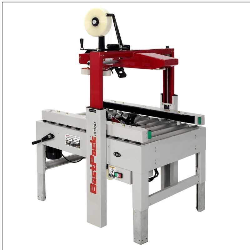
MSD22 Manual Side Drive

The BestPack™ MSD Semi-Automatic Uniform Carton Sealer is our most popular top of the line operator-fed and adjustable carton sealing machine, designed to cater to the needs of light-to-heavy duty uniform carton closure applications.