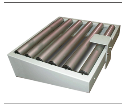
Infeed/Exit Conveyor w/ Unique L-Bracket