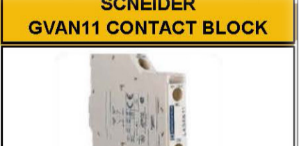
Part no: 20 EK 003