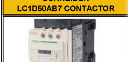
Part no: 20 KN 042