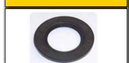
Part no: 15 BN 002