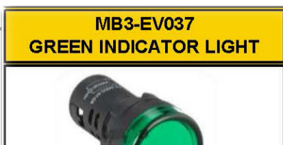
Part no: 20 LM 042