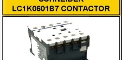
Part no: 20 KN 024