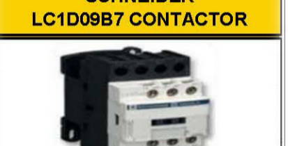
Part no: 20 KN 028