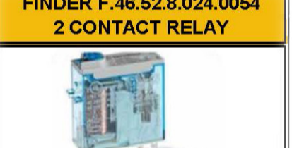
Part no: 20 RL 013