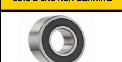
Part no: 15 RL 3212 002