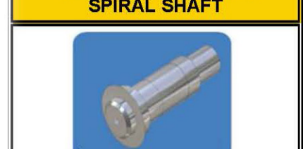
Part no: 90 HG132 048 HZ