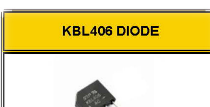
Part no: 20 DY 001