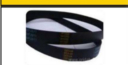
Part no: 90 HG131 280 HZ