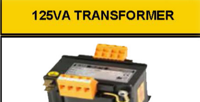
Part no: 20 TF 013