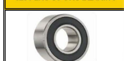
Part no: 15 RL 6206 003