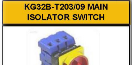
Part no: 20 SL 004