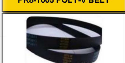
Part no: 90 HG130 025 HZ