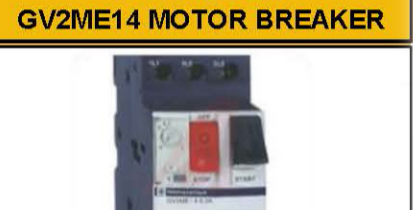
Part no: 20 MK 034