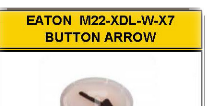
Part no: 20 BT 062