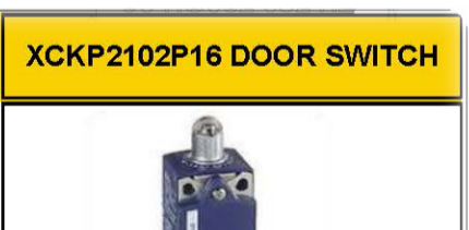
Part no: 20 SW 002