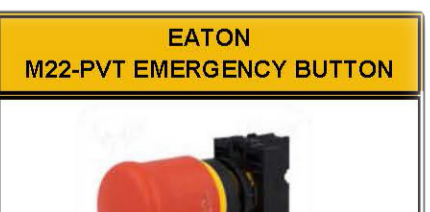
Part no: 20 BT 076