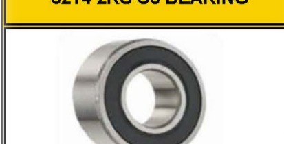
Part no: 15 RL 6214 001