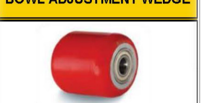
Part no: 15 PL 009