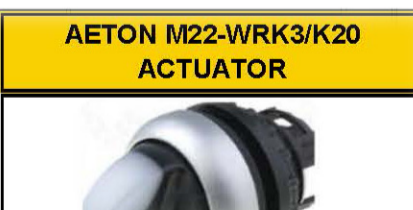
Part no: 20 BT 078