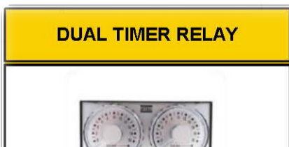
Part no: 20 ZR 008