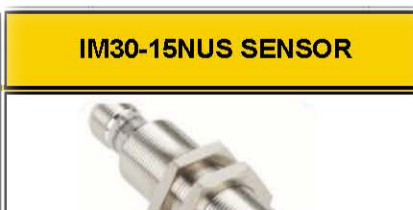
Part no: 20 SS 037