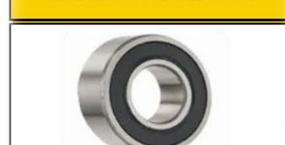
Part no: 15 RL 6212 002