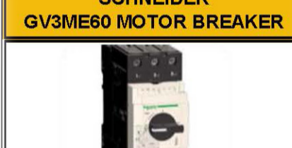
Part no: 20 MK 043