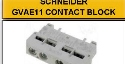
Part no: 20 EK 017