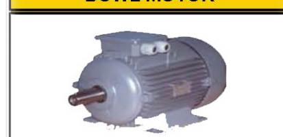
Part no: 15 MT 150 006