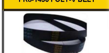
Part no: 90 HG131 279 HZ