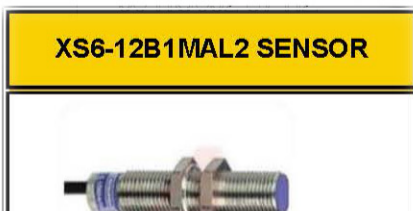
Part no: 20 SS 013