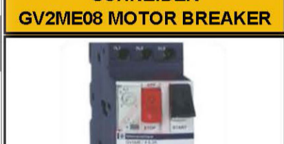
Part no: 20 MK 003