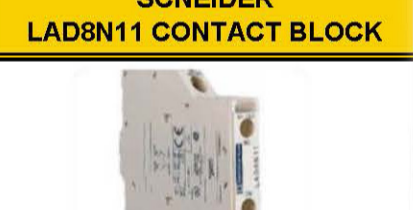
Part no: 20 EK 020