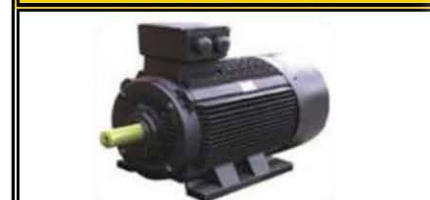
Part no: 15 MT 750 006