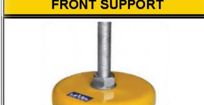
Part no: 15 PL 079