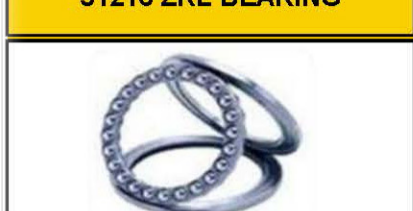
Part no: 15 RL 51216 003