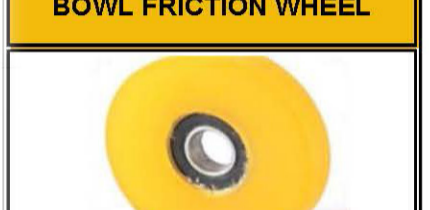
Part no: 210 0026 00