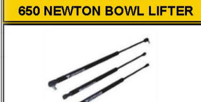
Part no: 90 HG130 279 HZ