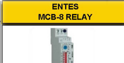
Part no: 20 ZR 003