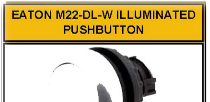
Part no: 20 BT 041