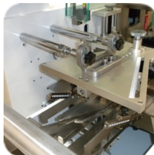
Adjustable Forming Box