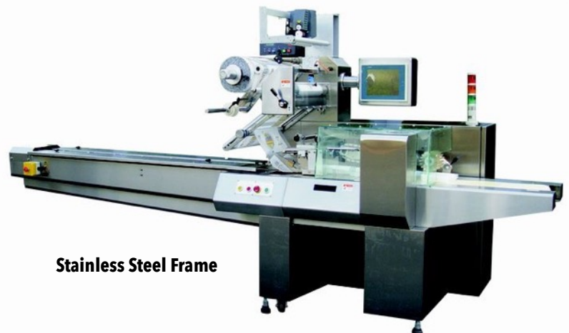
Stainless Steel Frame