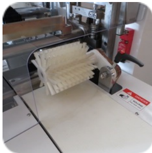
Discharge Brush Helps Separate Products