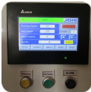
7" Color Touch-Screen HMI with 50 Program Memory

The S-5547 is a High Speed Servo Driven Flow Wrapper. Speeds of 30-150PPM with the Single Jaw and 200PPM with the Optional Dual Jaw.