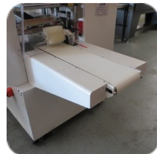
24" Long Discharge Conveyor