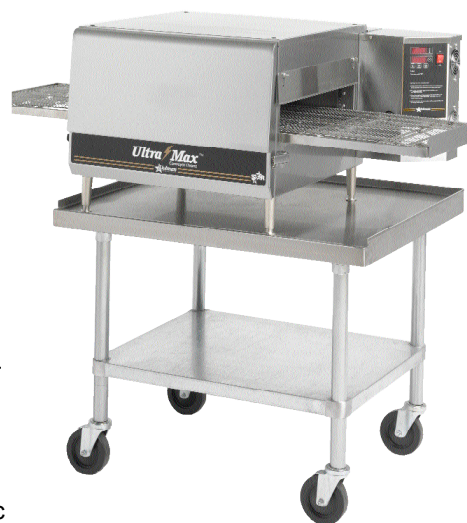
UM-1850A with Optional Stand