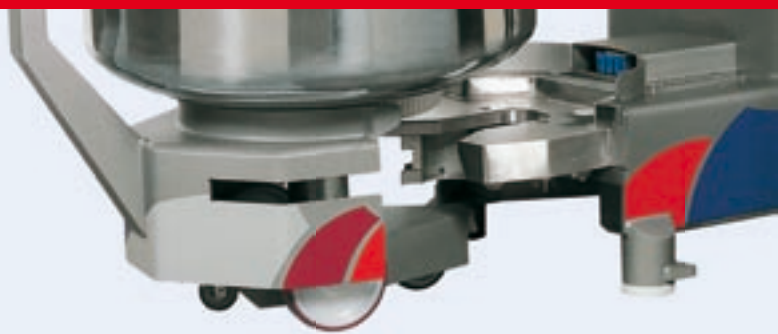
Mixing bowl driving gear