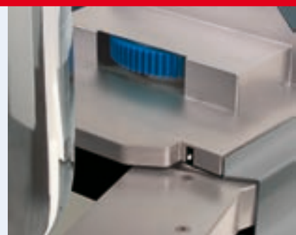
Bowl driving gear