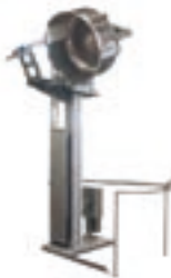
Bowl evacuation/ bowl rotation and scraper