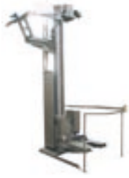
Lift with simple or double mast

VMI offer a large range of spiral AV or AVI mixers (from 80 to 900 kg dough), with several options in order to do small or large production of bread, Viennese pastries, pizzas. Robust and reliable, they guarantee consistent production thanks to the positively driven mixing bowl by means of a polyamide ertalon driving gear. The mixing bowl does not slip even when CO 2 or ice is being added.