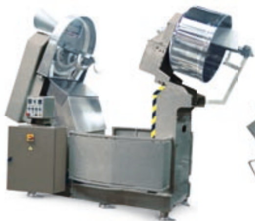
■ Mixer SPI 280 DEB