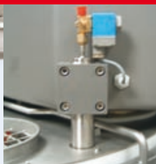
CO 2 injection valve