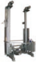
Bowl lifting and lowering with chains