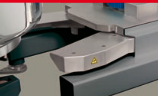
Hydraulic locking with lateral double clamps