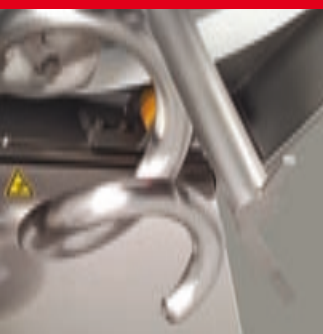
Stainless steel spiral one and a half turns with round pivot and scraper