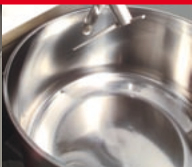
Stainless steel mixing bowl with flat bottom