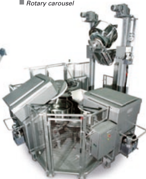
■ Rotary carousel