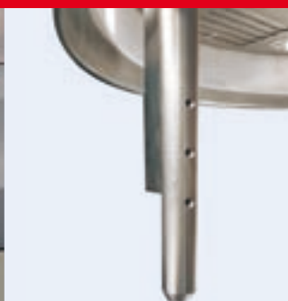
CO 2 injection probe