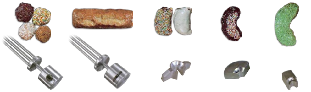
BALL (CUTS 2, 3 OR 4)

Type B & F plungers are identical. Type N plungers are sized for Type N only. The French Plunger will make French Crullers with French Cruller mix, or French Cake donuts with standard mix. For size and weight details, see over page.