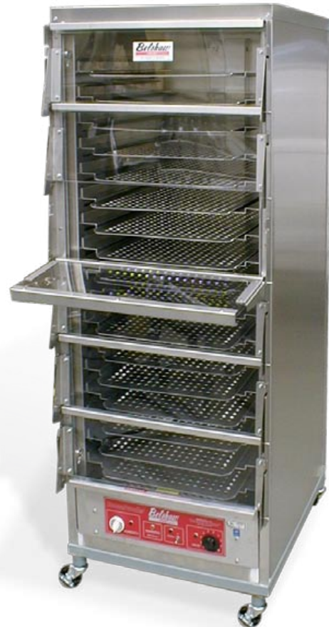
Belshaw EP18/24 Proofer