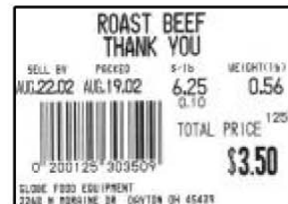
Standard Label (Part E11)