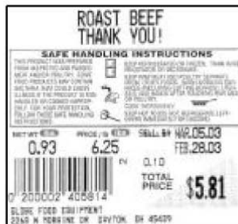
Safe Handling Label (Part E12)