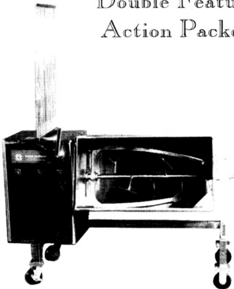
The Leland Southwest I-300DA90 Double Action Mixer

No more mini-loads. The Leland Southwest Double Action I-300DA90 provides the answer to your questions about increased productivity. Extra-large capacity increases production. And Double Action decreases mixing time. Such a combination increases profits whether you're upgrading a facility or starting a new business. Other features include a completely enclosed motor drive, a jog feature for easy unloading and polished 304 stainless steel construction for quick clean-up. The Leland Southwest I-300DA90 is USDA-approved, uses UL-listed components and is made in the United States. When profits matter most, call Leland Southwest at (817) 232-4482.