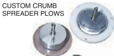
CUSTOM CRUMB SPREADER PLOWS