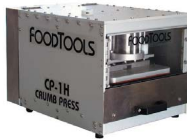
CP1H Crumb Press