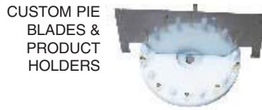
CUSTOM PIE BLADES & PRODUCT HOLDERS