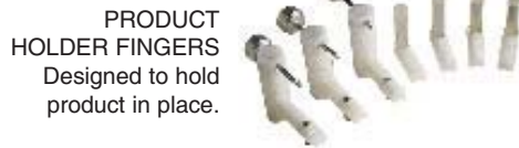
PRODUCT HOLDER FINGERS Designed to hold product in place.