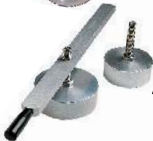
AIR COMPRESSOR DRYERS FILTERS