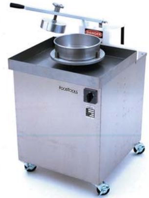
CS7A Crumb Spreader