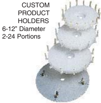
CUSTOM PRODUCT HOLDERS 6-12" Diameter 2-24 Portions