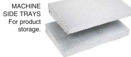
MACHINE SIDE TRAYS For product storage.